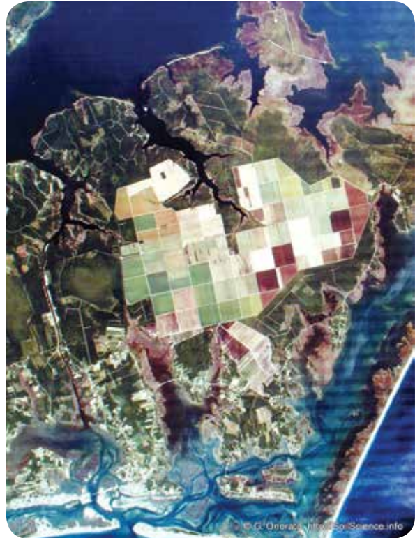
Gabriel Omorara, Soil Science, Flickr

By applying spatial and timely inputs farmers will be able to farm more economically, enhancing yields, reducing waste and minimising environmental impacts.